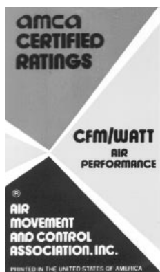
Figure 3. This label indicates that the fan has been tested by the Air Movement and Control Association (AMCA)

performed using the fans as they will normally operate, including use of guards, shutters, discharge cones, and other accessories. Beware of using manufacturers' data if it is not backed by an independent laboratory. Two laboratories, the Air Movement and Control Association (AMCA) in Chicago and the Bioenvironmental and Structural Systems (BESS) lab at the University of Illinois, are known to test fans impartially. AMCA has been the industry standard for many years. Fans that have been tested by AMCA will carry a decal similar to the one in figure 3.